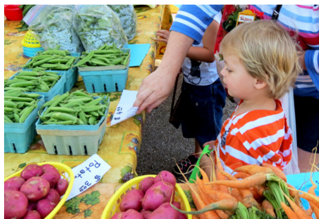
▲ 4 Rivers Fresh Foods, a food hub serving northwest Mississippi, aggregates, distributes and markets locally grown produce to households, schools and institutions.