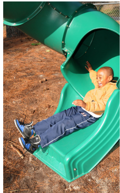
▲ Rural North Carolina communities sought to improve community health by implementing innovative and integrated strategies to increase physical activity.