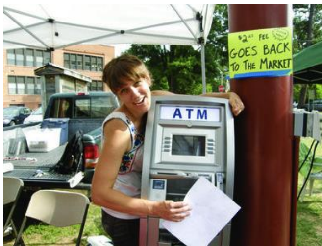
Carrboro Farmers' Market staff member with the market's ATM machine.

Contact information for this market is located in the Resources Section.