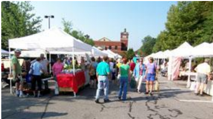
Asheville City Market in full bloom.

Contact information for this market is located in the Resources Section.