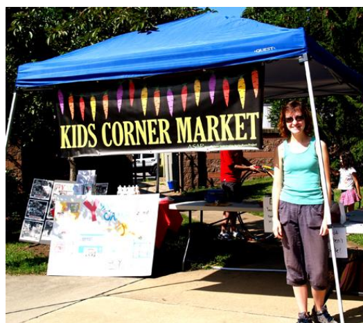
The Asheville City Market's Kids Corner Market

Contact information for this market is located in the Resources Section.