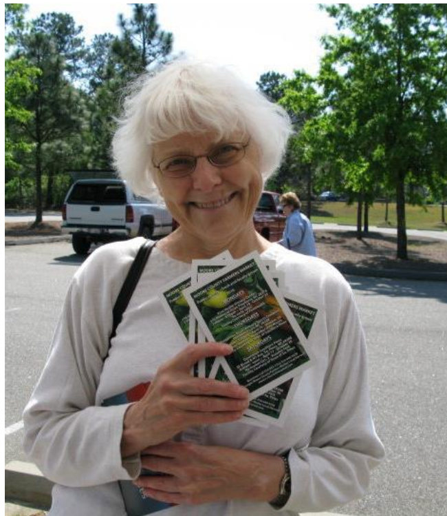
A Moore County Farmers' Market customer with outreach flyers explaining the SNAP/EBT match.

Contact information for this market is located in the Resources Section.