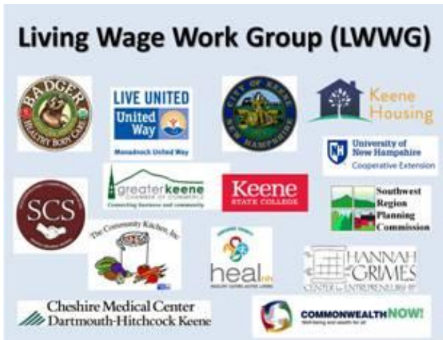
Monadnock Region, NH