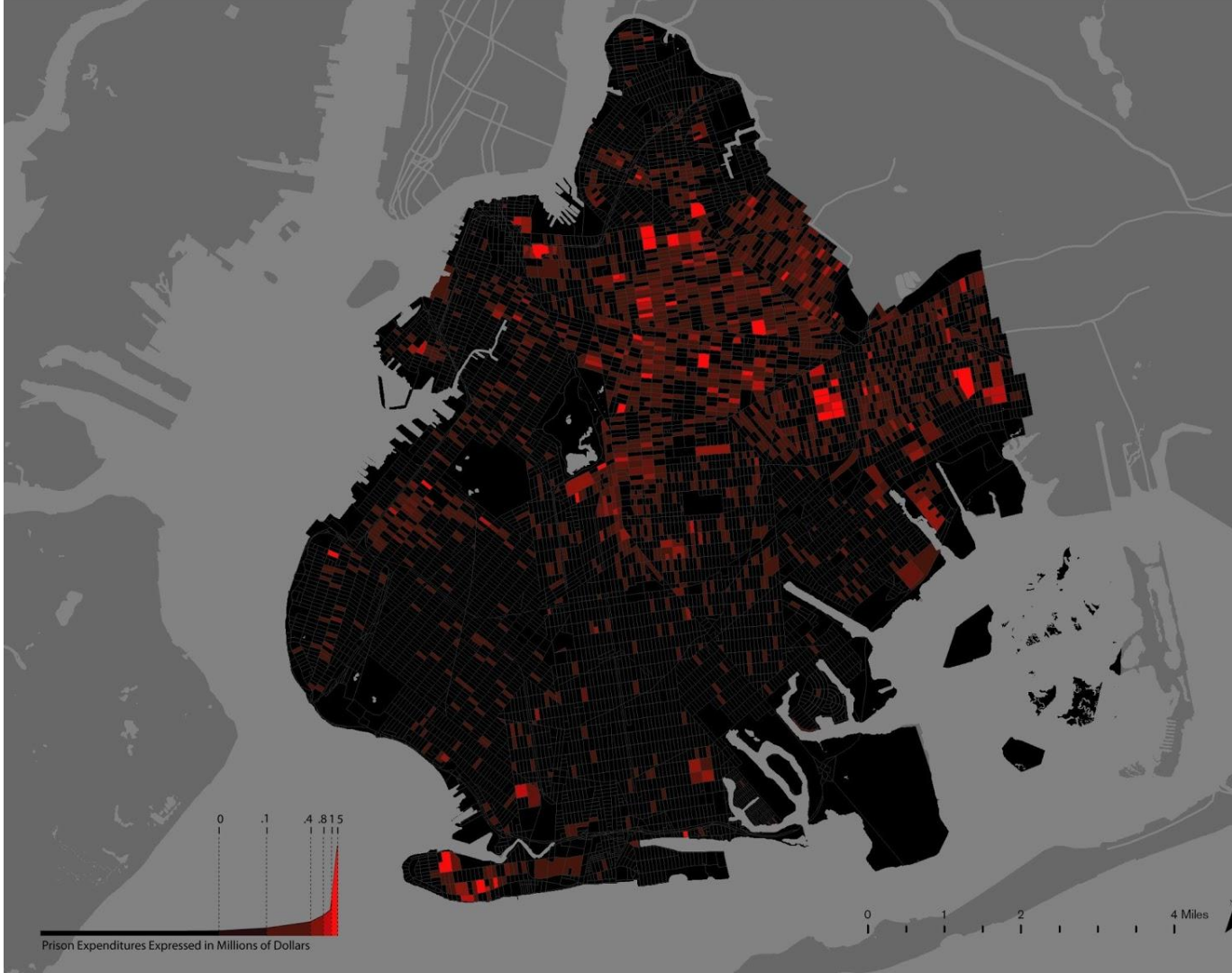
Prison Expenditures Expressed in Millions of Dollars