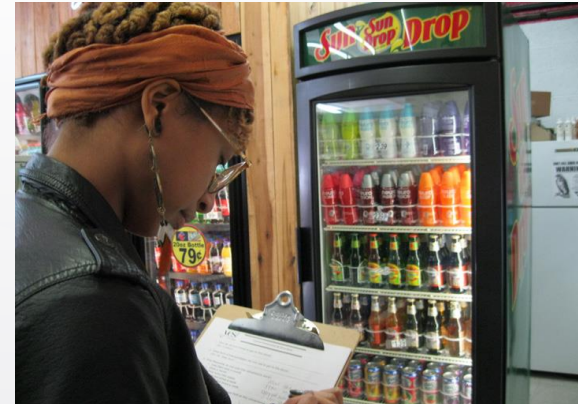
they learn how to identify and research problems