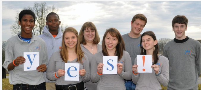
YES! hires high school students