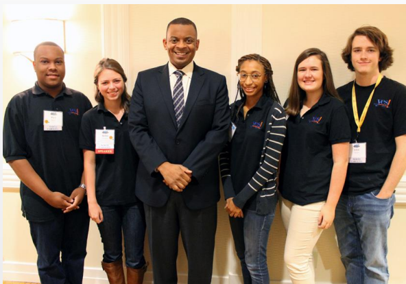
engage key stakeholders