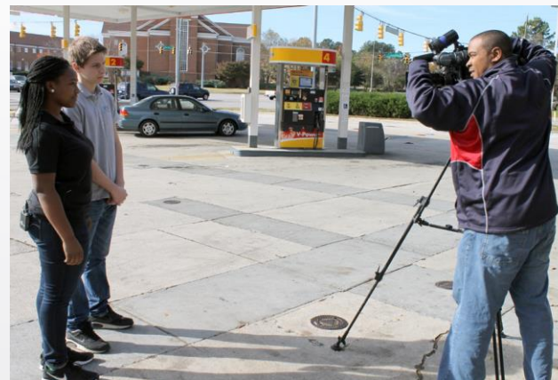
work with the media