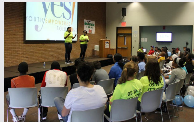
gather community support