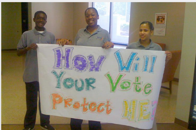
and change local and statewide policies